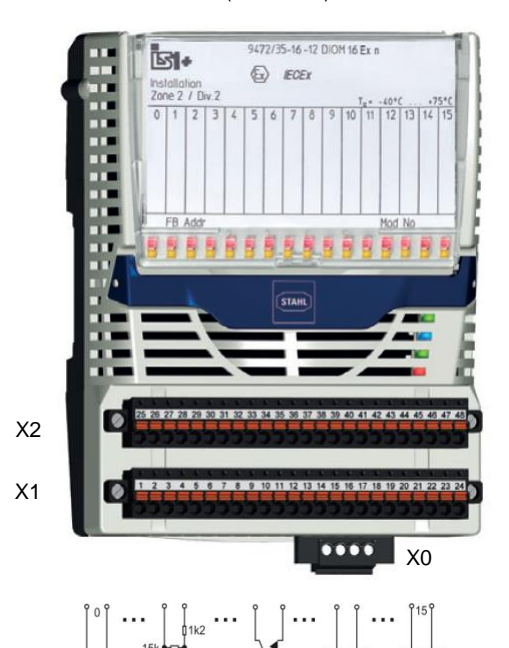
Approved NAMUR proximity switches, optocouplers, solenoid valves

Nonhazardous (Unclassified), Class I, II, III, Division 2, Group A-D or Class I, Zone 2, Group IIC/IIB Hazardous (Classified) Locations