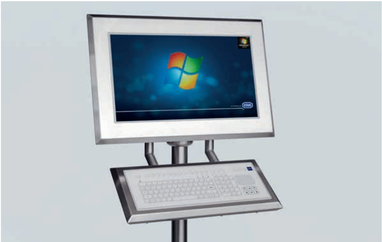
MANTA GMP as Panel PC

The MANTA GMP device series provides operator stations that are specifically for use in cleanrooms. They meet the requirements of advanced process control and visualisation in hygienic environments.