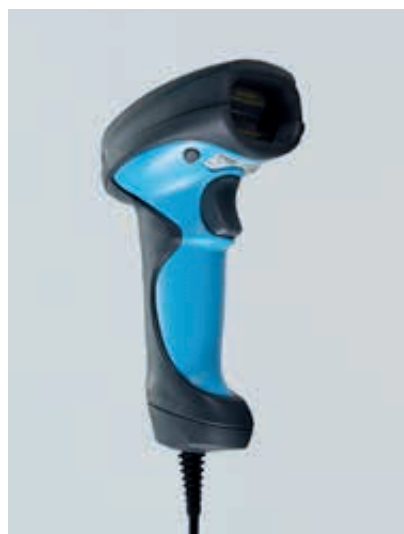
Corded/wireless IDM barcode scanner