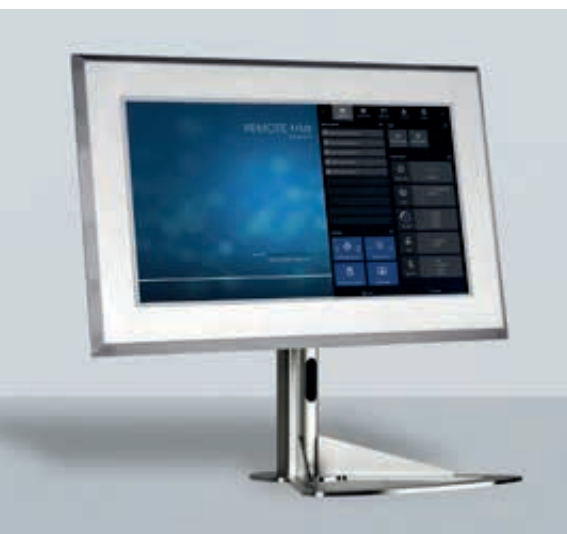
Customer-specific desktop solution

The safe area model variants are connected directly to the USB ports. Data is transferred with a high level of protection using Crypt encryption, or open using the ASCII protocol.