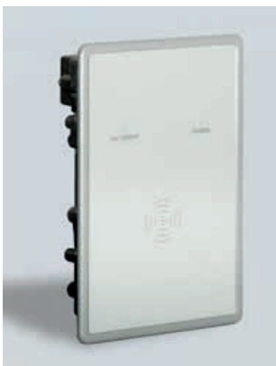
RFID card reader using Crypt or ASCII protocol