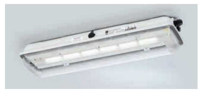
LED linear luminaire in neutral white light colour (5000 K)