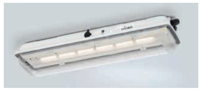
LED linear luminaire in warm white light colour (4000 K)