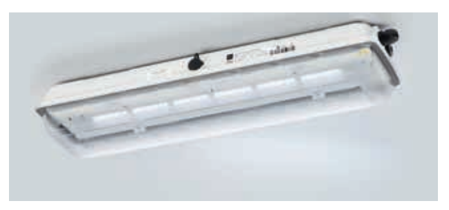
LED linear luminaire in cold white light colour (6500 K)