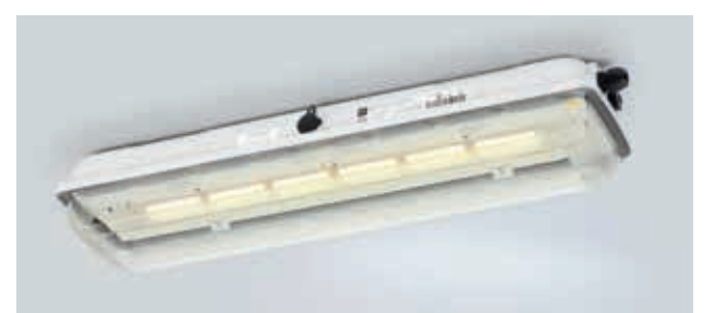
LED linear luminaire in yellow light colour (< 3300 K)